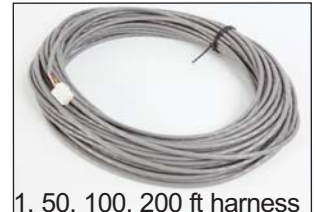
1, 50, 100, 200 ft harness