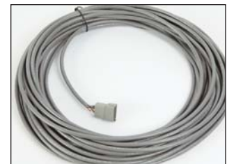
1, 50, 100, 200 ft harness

A029U298 1 ft A029U303 100 ft A029U302 50 ft A029U304 200 ft Easy plug-n-play harness connects low voltage wiring between generator and transfer switch. Harness plugs into generator and is trimmed to length at the transfer switch. Color coded wires are connected color-number to RSS terminal block. The 1 ft harness allows connection of installer provided wires between the genset and ATS. Includes harness with water tight Deutch plug and label with color-numbered wiring instructions. Compatibility: RS13A/AC, RS14AF, RS20A/AC generators and RSS transfer switch models.